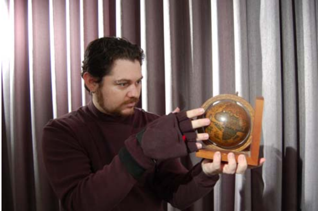
Figure 1. Interacting with tagged objects using the Reading Glove

associated with the object being handled. For further details on the technical and interaction design elements of the glove, please see the forthcoming paper [29]. Our intention with the design of this system was to create an interactive story where the physical experience of the objects was integral to the construction of meaning in the mind of the reader.