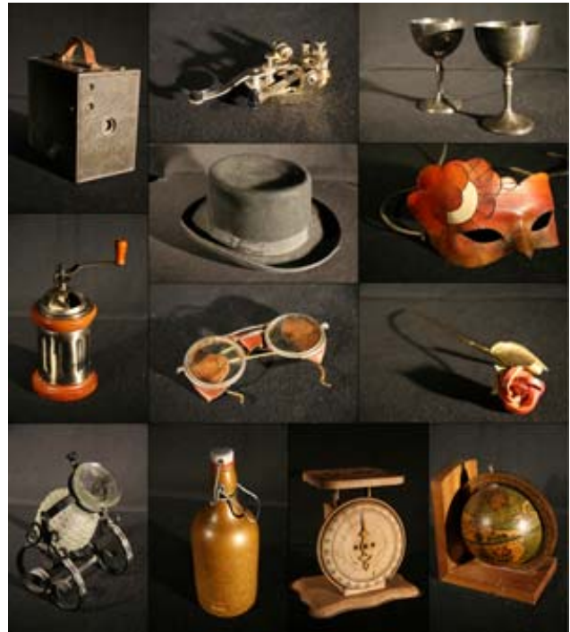
Figure 2. The 12 narrative objects

After several weeks of collecting and assembling, we settled on a set of 12 objects [Error! Reference source not found.]. These included (top to bottom and left to right) an antique camera, an antique telegraph key, a pair of silver goblets, a top hat, a leather mask, a coffee grinder, antique goggles, a wrought metal rose, a glass vase on a metal stand, a ceramic bottle, an antique scale, and a bookend with a globe on it.