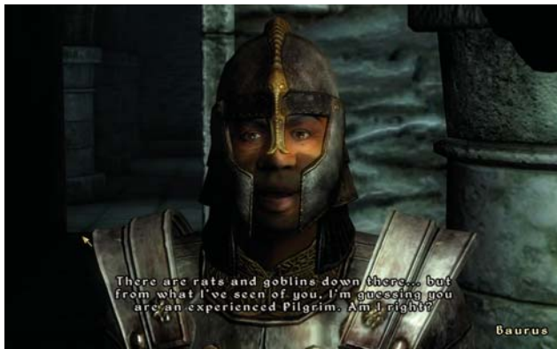
Figure 3 Oblivion [9] attempts to interpret the commitments of the player and recommend a class.

Commitment as entailed by the illocutionary point of an utterance is critical to establishing trust and communication between actors, as seen in improvisational theater as well as everyday conversation. People who make assertive statements that are shown to be false, or who make commissive utterances that they do not follow through on will be judged untrustworthy and unreliable. In our previous paper, we argued for a way of thinking about gaming not as players interacting with a system but as performers improvising within a story. Under this conception, designers and performers are in a type of conversation with each other, mediated by the game. By looking at the ways in which human conversation creates meaning and commits speakers to action, we can gain an interesting perspective on how we might design a game system which provides similarly satisfying ways to engage and commit. Perhaps equally importantly, by looking at ways in which this dialogue breaks down in popular games we can learn important lessons about designing games that support commitment.