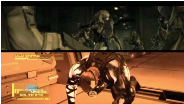
Figure 2. Solid Snake struggling through the microwave tunnel in Metal Gear Solid 4

The other example given by Burch is even more telling. He describes a sequence at the end of Metal Gear Solid 4 [19] in which the hero, Old Snake , must traverse a tunnel filled with deadly microwave radiation in order to prevent the destruction of the planet. [Figure 2] The microwave tunnel sequence is widely regarded as one of the most powerful and emotional moments in contemporary games; a quick search of the Playstation 3 forums or of the many YouTube videos in which the sequence may be viewed reveals hundreds of players talking about how they cried during it [4, 5].