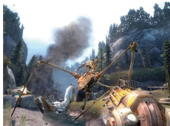
Figure 1. Defending the White Forest base against Striders in Half-Life 2: Episode 2

Burch provides two examples of games in which this approach is effective. In his first example, Half-Life 2: Episode 2 [37], he describes a climactic scene in which the player must defend a base from an onslaught of alien “striders”. [Figure 1] In order to provide the desired emotional arc, the designers carefully stage the pace at which the aliens progress through the base, modifying the density of the enemies and the efficacy of the AI resistance on the player’s side. The stated goal of this design is for the player to feel a sense of heroic effort without actually being able to fail the mission (except through exceptionally bad play). In this example, taking control over the outcome out of the hands of the player is used to craft a more intense play experience and a more intense narrative experience.