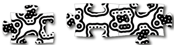
Figure 1. Unique markers are distributed across pieces.

In this paper, we provide the design goals for our original EventTable prototype followed by a description of our system implementation and three variations of distributed marker tracking. We illustrate our technique by describing three examples of object tracking designs which utilize distributed markers implemented on EventTable. Two of these examples use our distributed marker technique alongside traditional tracking of individual objects tagged with whole markers. We then discuss the advantages of this technique in terms of technical reliability and prototyping flexibility. We conclude with new directions for tabletop research based on an event-based approach.