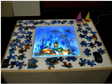
Figure 4. Tangible jigsaw puzzle on EventTable.