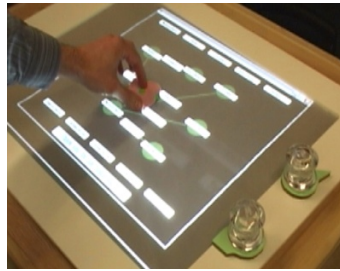
Figure 5. Tangible concept mapping system on EventTable.