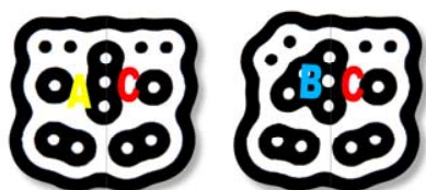
Figure 2. Multiplex: half markers A and B both can connect to half marker C to create whole markers AC and BC.

This method works for cases where there is a requirement for one object to connect to more than one other object.