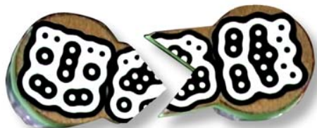
Figure 3. Combined whole and distributed markers.

It is also possible to place a whole marker and a portion of a distributed marker on a single object (as shown in Figure 3). This method of combining whole markers with distributed markers can be used when a single object is to be used in different ways, one of which involves being connected to another object.